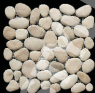
PEBBLE TAN AND WHITE