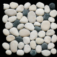
PEBBLE WHITE, TAN AND BLACK